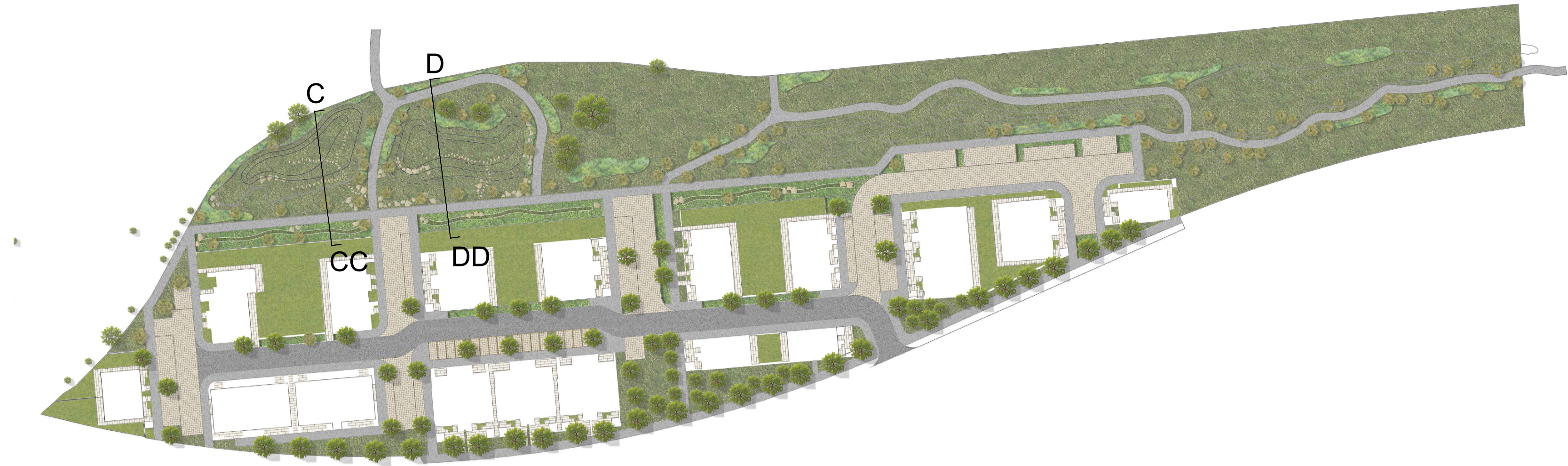
Location Plan 1:1000